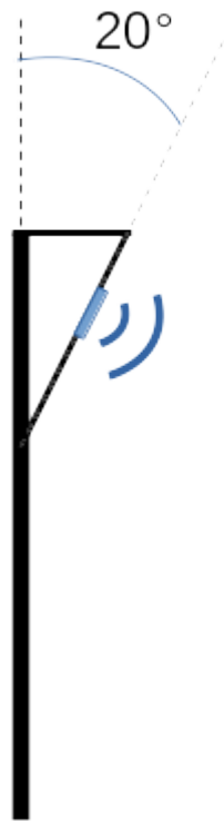
Figure 2: Illustration of the sensor mount with angle used in testing the pole mounted case.

In the pole mounted case (when the sensor looks at the car from the side) there are a few issues found in testing. Since a car hood often consists of large flat surfaces which can deflect the signal instead of reflecting it, there is a risk that a car can appear “invisible” to the sensor. The most natural way to mitigate this issue is to tilt the sensor slightly downwards, which often catches the front of the car, which more often than the hood has reflective surfaces more perpendicular to the sensor. All pole mounted tests were performed with the sensor angled slightly downwards, see Figure 3 and Figure 2.