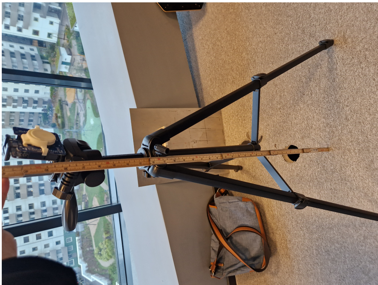
Figure 3: Test setup for the pole mounted testing, note that the sensor is tilted slightly downwards (about 20 degrees from a ground perpendicular axis). An FZP lens was also used, as seen in the picture.

The pole mounted case intends to simulate when the sensor is mounted inside an electric charging station or similar where the sensor is looking at the car from the front (or back), either at an angle or direct ahead. A preset for the pole mounted case can also be found among the presets in Exploration tool. This case was tested with an FZP lens, see Figure 3.